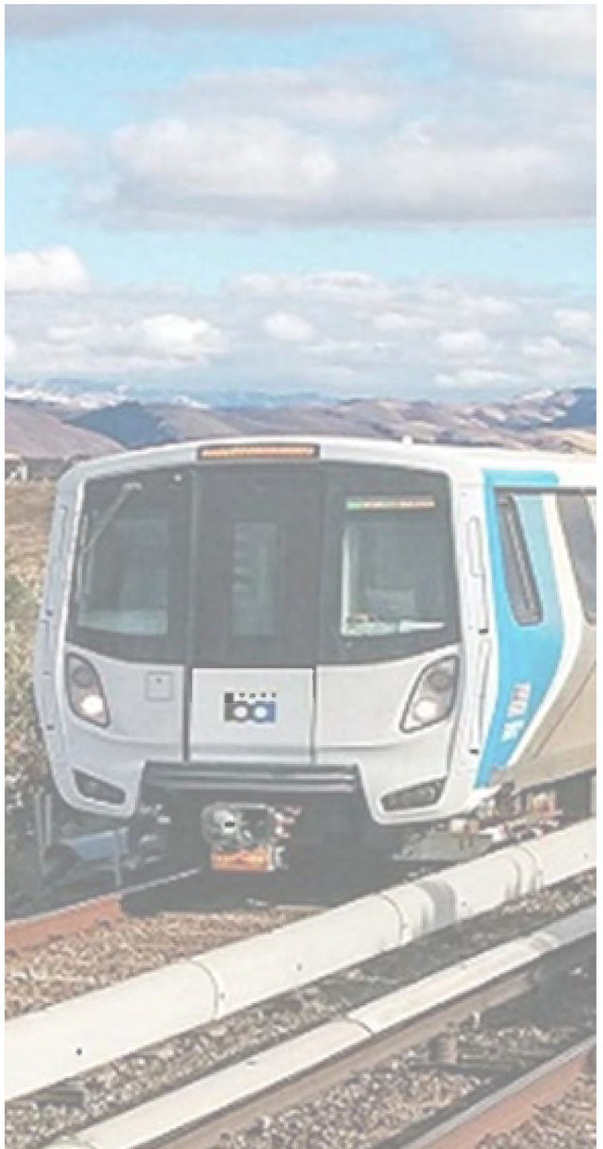
Image Credits: The investigation and presentation illustrations are by Sergei Tikhonov and published under the MIT License. All other illustrations are by Unknown Authors and are licensed by Creative Commons . The photo images are BART property. All images are used only to enhance public information.