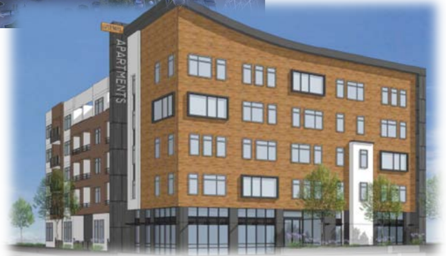
Veterans Affordable Housing