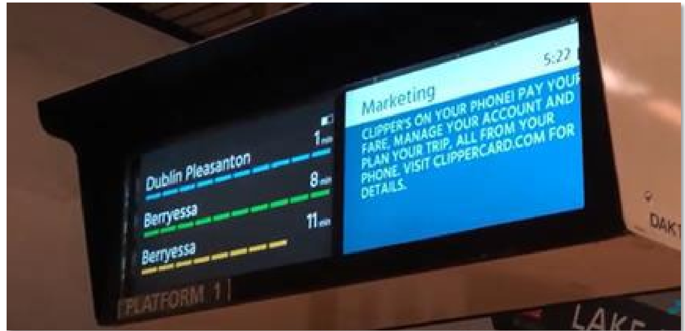
Lake Merritt Station