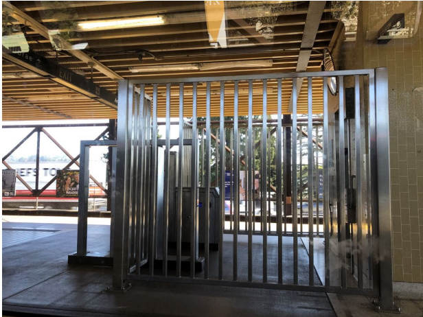
C10 Rockridge – Jul 2022