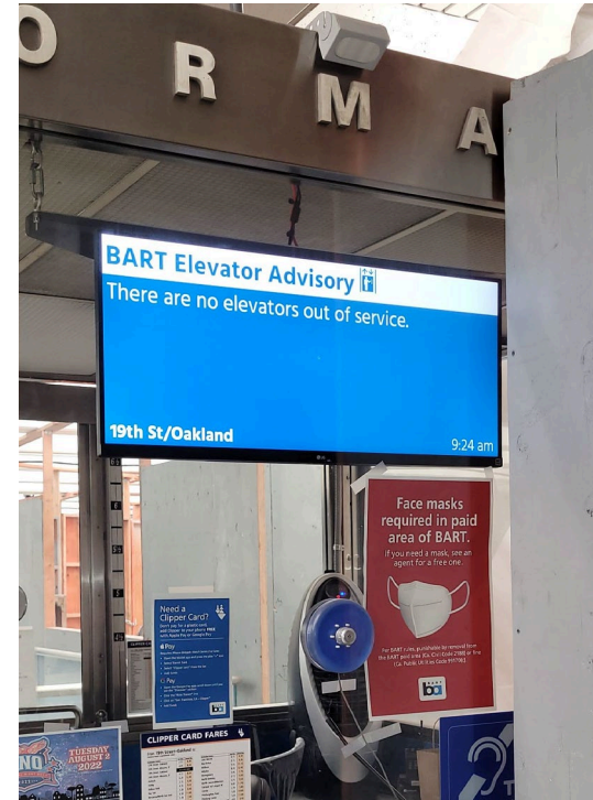
19 th Street Station