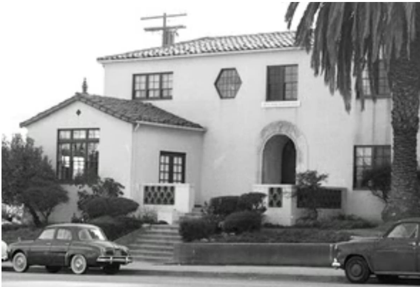
Ming Quong Home was an orphanage for Chinese girls