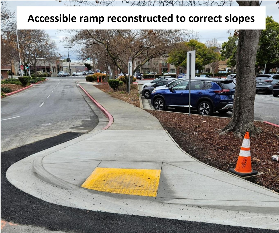
Accessible ramp reconstructed to correct slopes