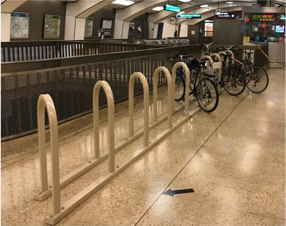
Berkeley Station Concourse Racks