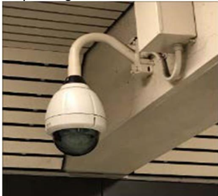
Sample Image of Semi-Visible CCTV camera

The various types of cameras that are employed for public surveillance purposes include visible and semi-visible, each having its own purpose. Visible cameras are intentionally designed to be visible to the public and for the most part, one can easily detect what is being recorded by the direction of the camera. Semi-visible cameras have become increasingly more common. These cameras have a dome-shaped covering that prevents the public from identifying the direction the camera is facing. For crime prevention efforts, this type of camera is more effective for deterrence purposes because would-be offenders are unable to determine whether they are being recorded and may therefore refrain from criminal activity due to fear of apprehension.