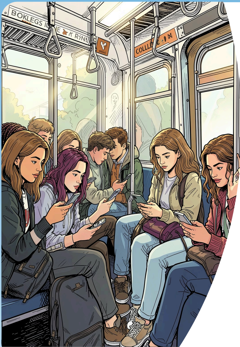
Client: Tip Eonsto & Catecs