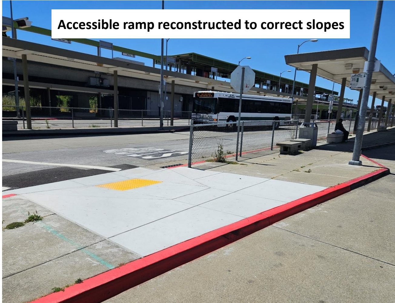
Accessible ramp reconstructed to correct slopes