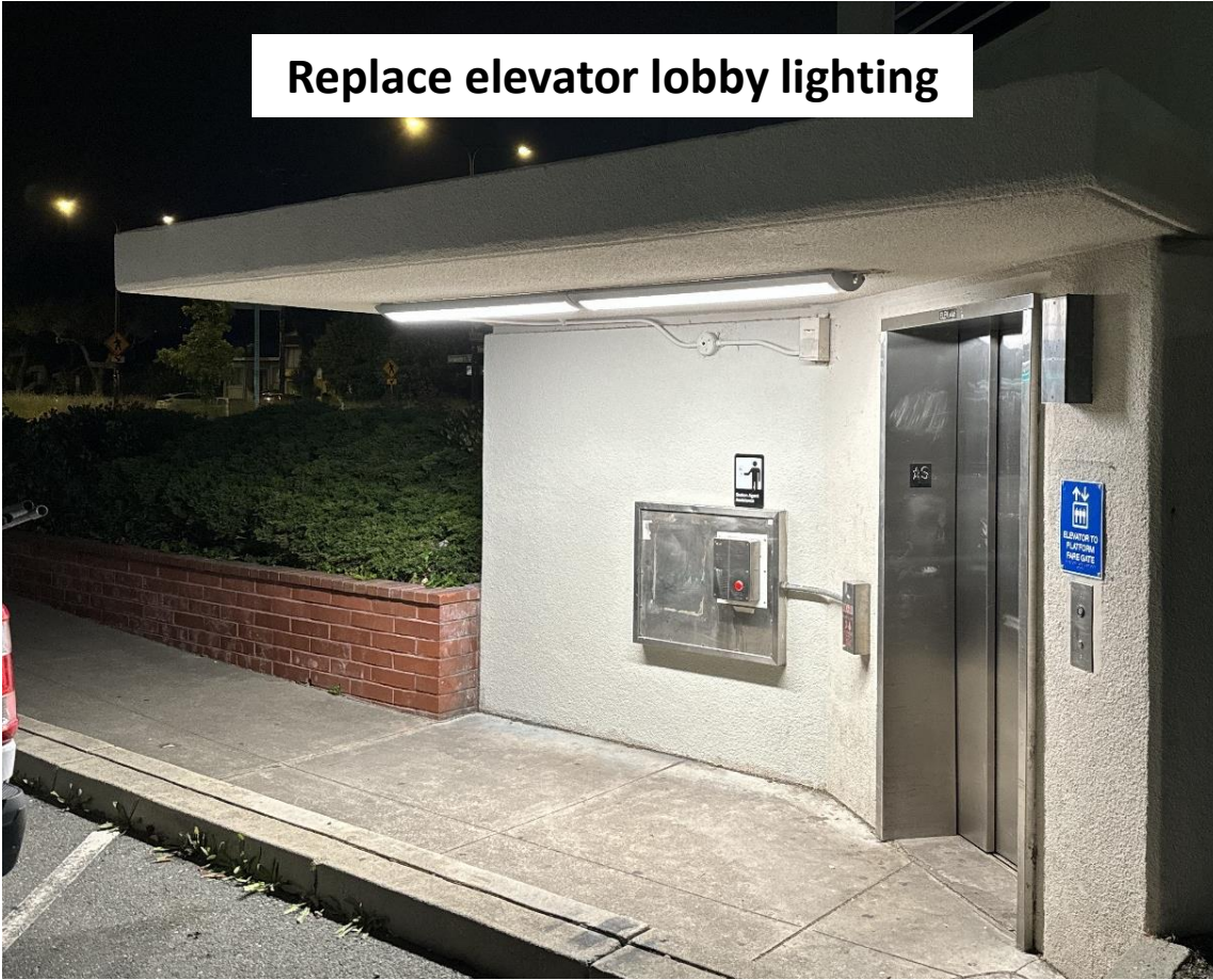
Replace elevator lobby lighting