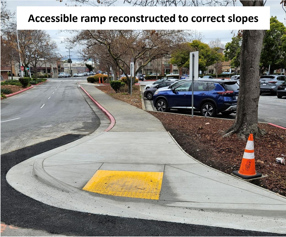
Accessible ramp reconstructed to correct slopes