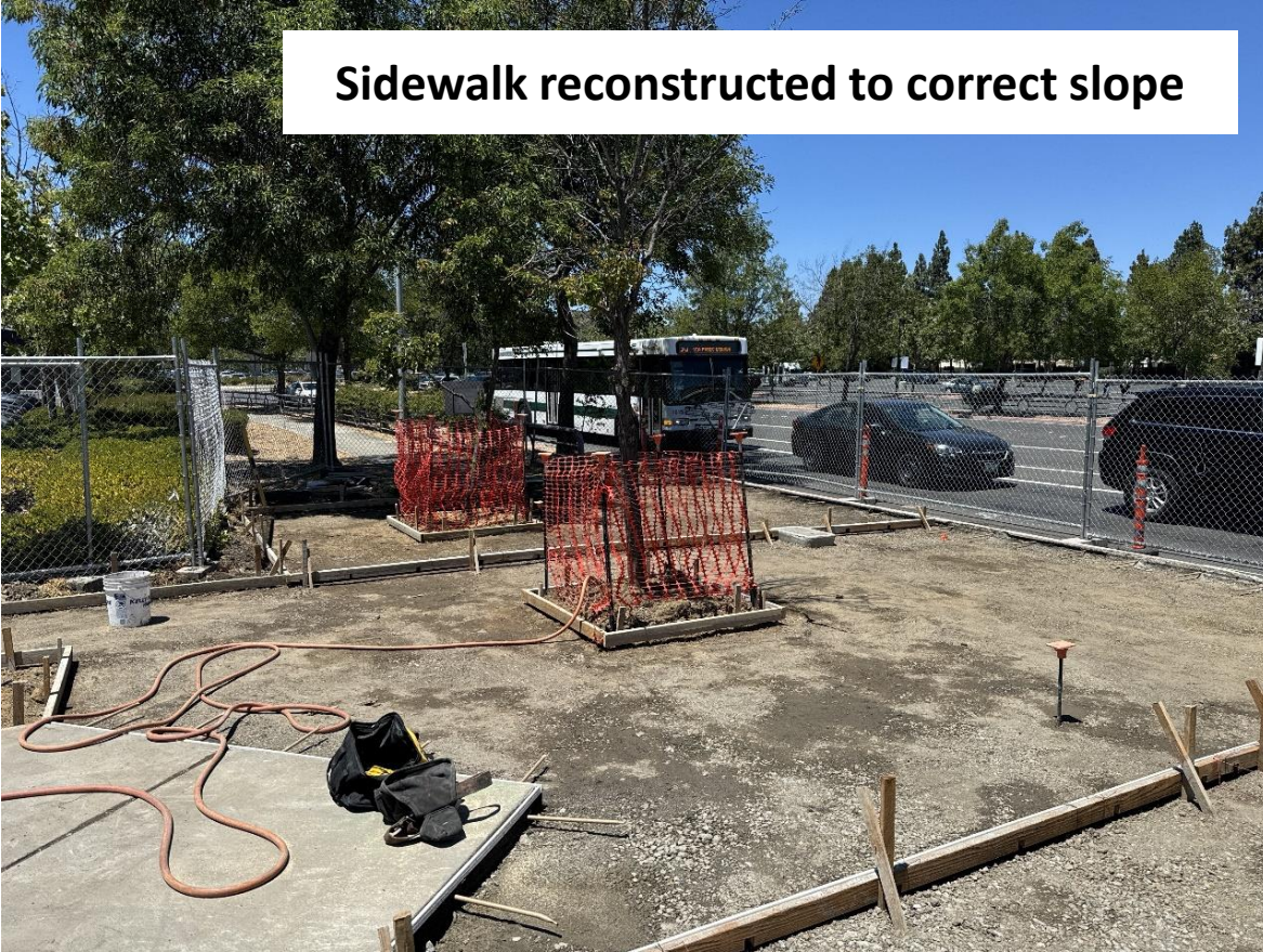
Sidewalk reconstructed to correct slope